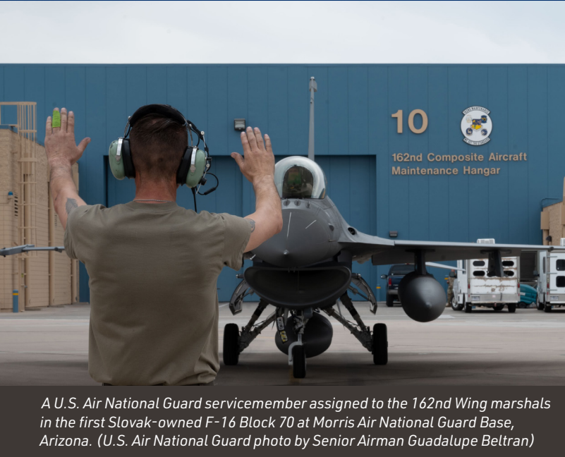
A U.S. Air National Guard servicemember assigned to the 162nd Wing marshals in the first Slovak-owned F-16 Block 70 at Morris Air National Guard Base, Arizona.