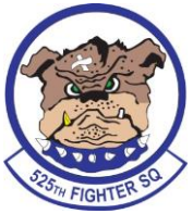
525 th Fighter SQ