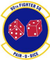
90 th Fighter SQ