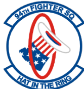
94 th Fighter SQ