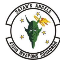
433 rd Weapons SQ