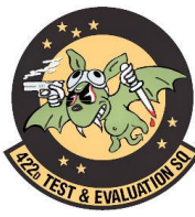
422 nd Test & Eval SQ