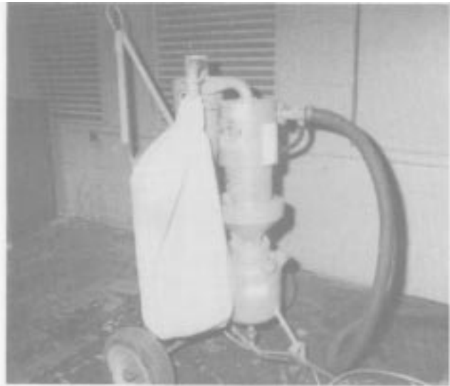
Most corrosion must be removed mechanically; in many cases an abrasive blaster can speed up the cleaning chore.

location and accessibility of the corroded area, the degree of damage, and the type of corrosion involved. A typical corrosion removal sequence proceeds as follows: