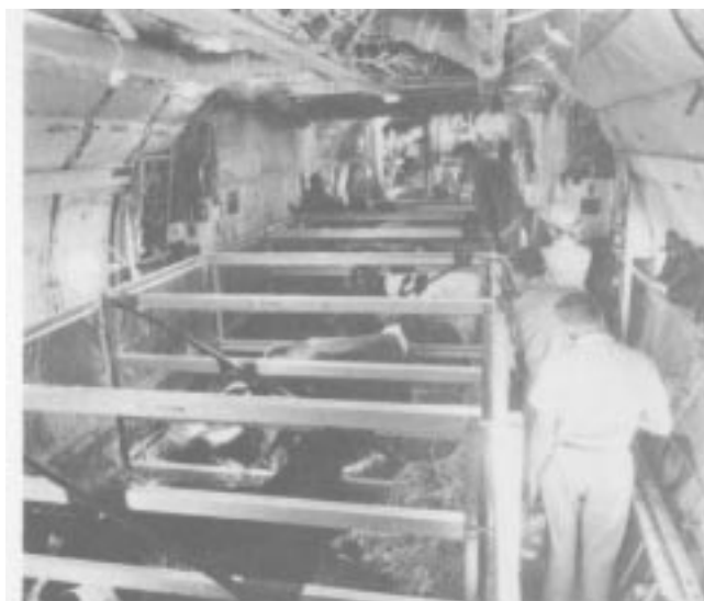
Aircraft interiors must be cleaned thoroughly after each mission involving the transportation of animals.

Finding corrosion is perhaps as important as removing it because once the corrosion is found and documented, the airplane's condition has become a "known." As long as safety of flight is not affected, the corrosion may be removed at another time.