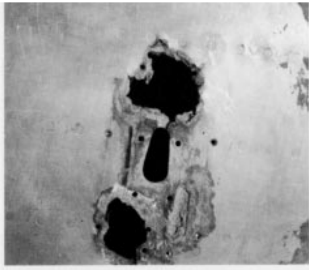
Structure under antennas is a common site for corrosion, particularly where the antenna is not sealed, or gaskets have been damaged.