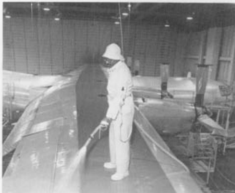
Washrack workers need the protection of safety harnesses when working on the upper surfaces of the aircraft.

Whether the operator has enough work to justify a dedicated crew or not, everyone engaged in cleaning airplanes must be thoroughly trained. In addition to the personal safety aspects, the crew must be knowledgeable about the handling, mixing, and storage of all chemicals used on the washrack. Each crew member must also know how to use the chemicals, tools, and equipment without causing damage to the airplane.