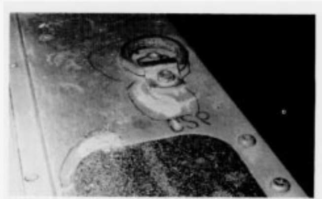
The corrosion resistance of the cargo floor chine caps can be enhanced by cleaning, sealing, and painting the upper surfaces.

On all airplanes, look for corrosive fluids, dirt, chipped or deteriorated paint, and missing or damaged sealant on structure under and around these installations. After cleaning and drying, carry out the necessary corrosion, paint, and sealant repairs. Apply a coat of non-water-displacing CPC to the underfloor areas and especially to areas directly