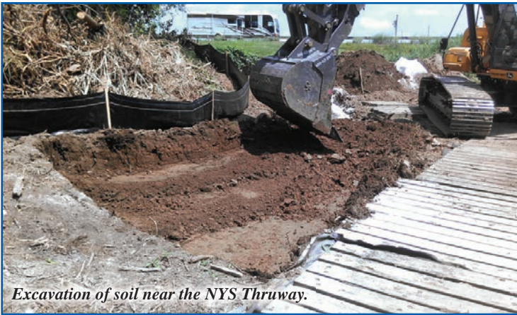
Excavation of soil near the NYS Thruway.

Residents with questions or concerns about the cleanup activities are encouraged to call 315-456-2150.