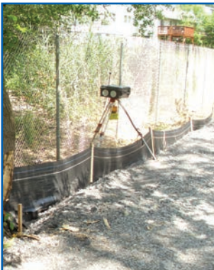
Air monitoring station and silt fence for erosion and sediment control.

any debris from the site. As a precaution, and to ensure site neighbors are not affected, we continuously monitor for dust to ensure the State regulations are not exceeded. If at any time a dust monitor indicates an exceedance, work will be stopped immediately and not continued until measures have been taken to correct the issue.