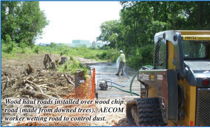
Wood haul roads installed over wood chip road (made from downed trees). AECOM worker wetting road to control dust.

with seed, shrubs and trees, and restoring the brook side banks to enhance flow and storm water movement.