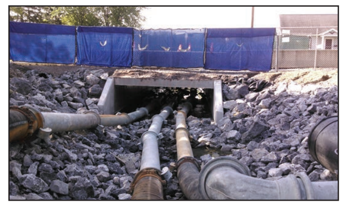
Bypass pump piping running through the new concrete box culvert underneath Brookview Lane.

Now that remedial construction activities have progressed from the open wooded area into the neighborhood area, some new activities have started. In the beginning of August, Brookview Lane was closed from Midwood Drive to Floradale Road, to allow the replacement of the culverts which carry the brook under the road. The two old, metal corrugated culverts were removed and replaced with a single concrete box culvert. The culvert work at