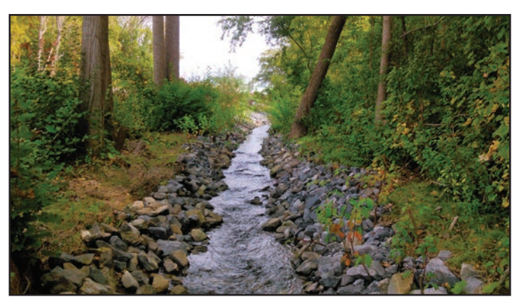
Upstream portion of Bloody Brook with restored channel and side banks

Brookview Lane took longer than anticipated because the concrete took longer than expected to harden, and the roadway was only recently partially opened to two-way traffic. This fall Brookview Lane will be paved and the full width of the culvert will be opened to traffic. Lockheed Martin and AECOM are using the lessons learned on the first culvert replacement to ensure that the next two culvert replacements at Sunflower Drive and Floradale Road will proceed quicker. Currently, work is being conducted on the Sunflower Drive culvert, and Sunflower Drive is closed between its two intersections with Floradale Road.