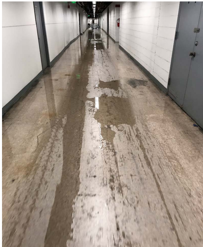
Flooding down hallway in northern portion of Building C basement