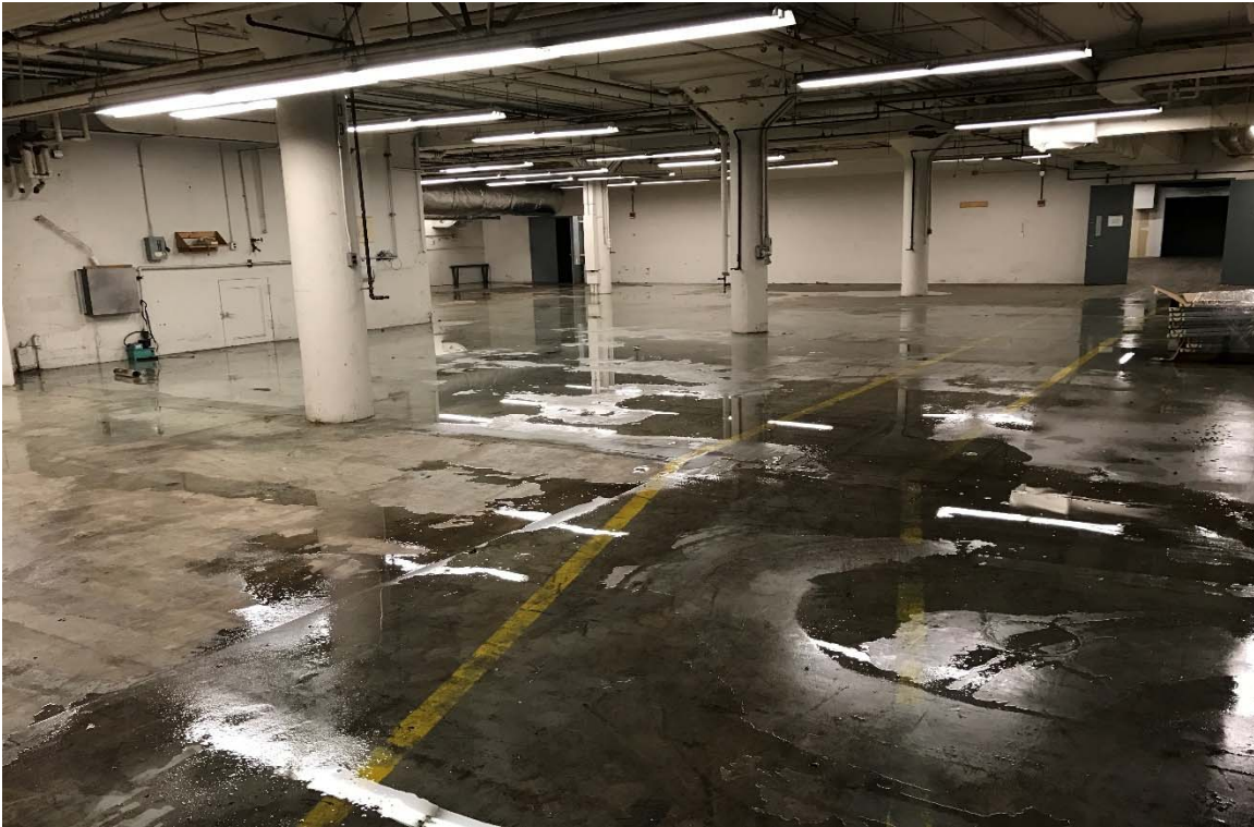
Flooding in northern portion of Building C basement