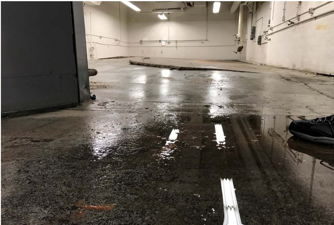
Ground level view of vacant room showing uplift of floor