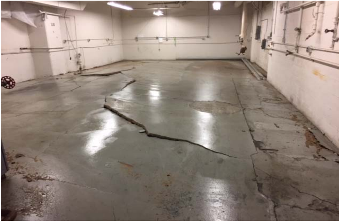
Vacant room between columns M9/10 and K9/10 showing cracked floor