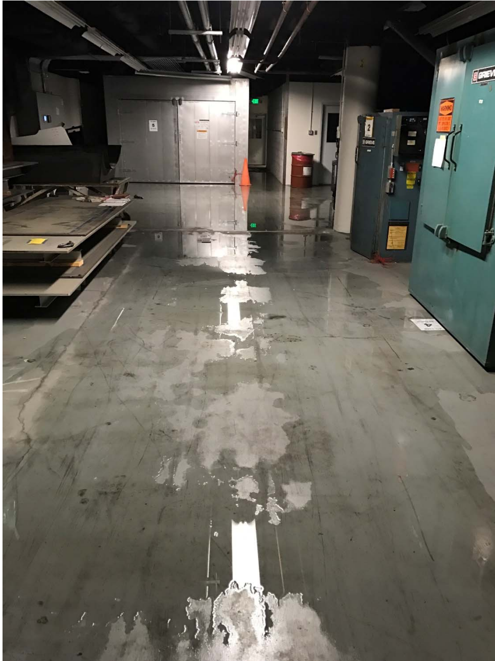
Flooding in northern portion of Building C basement