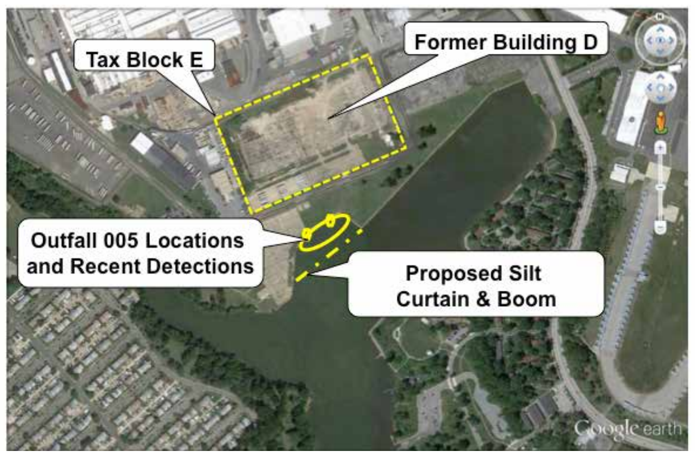
Area of recent sediment findings at Middle River Complex.

cove), we are proposing to put a silt curtain in place to assure that the contaminants don't move. We are also proposing to put a boom in place in the water to limit access to the area by