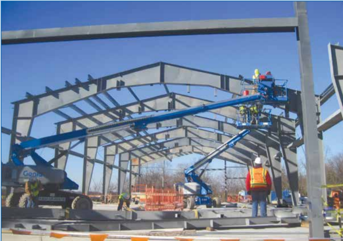
The steel framework for the groundwater treatment facility was fabricated off-site and erected in place early this past winter.

By the end of June the building and treatment system should be complete. Once the Maryland Aviation Administration has conducted final inspections and