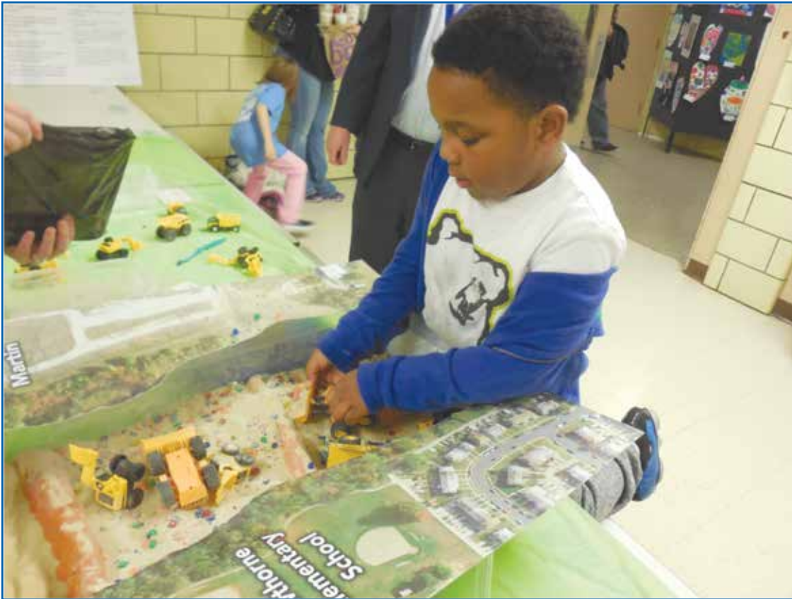
Children enjoyed creating work models of the upcoming sediment project.