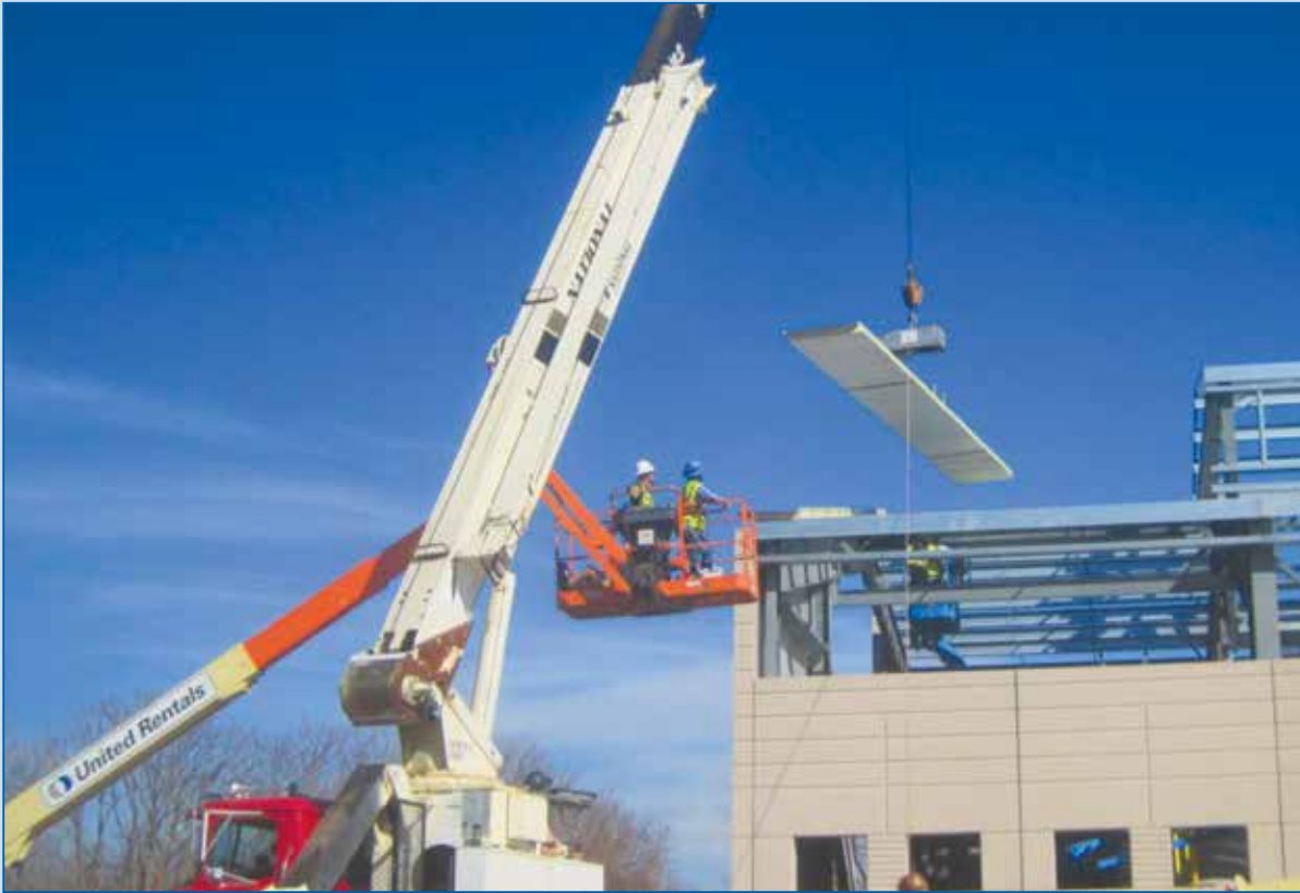
Roof panels were placed after the concrete walls were raised. The building should be watertight by the end of April.

issued an occupancy permit, operational testing will begin. The system will be tested initially using clean water from the water main. This phase of testing will check for leaks and make sure that pumps and control systems operate as designed. Following successful completion of these tests,