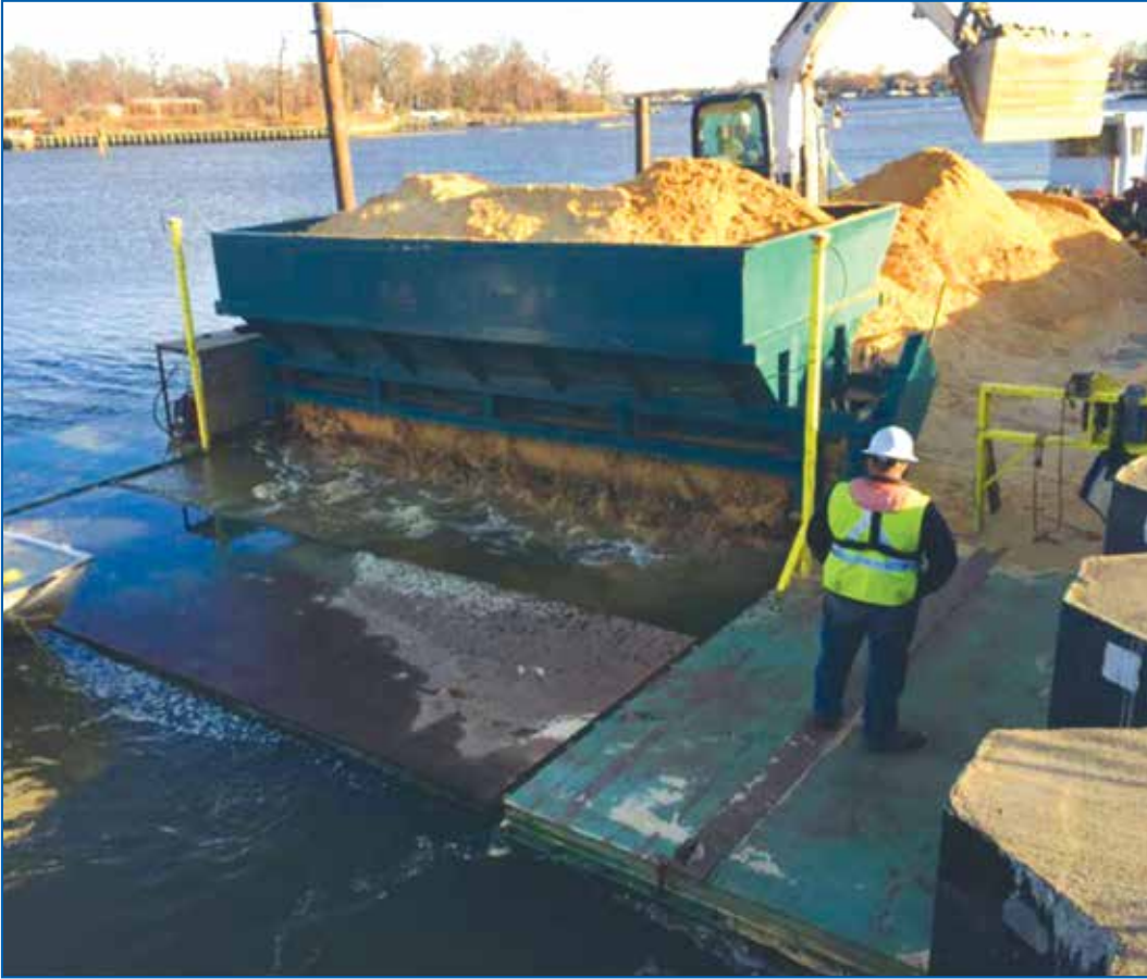
Hoppers filled with sand were barged to dredged areas of Dark Head Cove and Cow Pen Creek for placement.

During this past winter's dredging, approximately 36,000 cubic yards of sediment were removed and shipped in approximately 2,000 truckloads to the permitted landfill in York, PA. Before being moved the sediment was drained and dried in specially constructed bins located in the materials-handling area. The approximately 160,000 gallons of water that drained off the sediments were treated and discharged under permit to the Baltimore County sewer system. The drained water was tested following treatment and the quantity of contaminants in the water was within permit requirements.