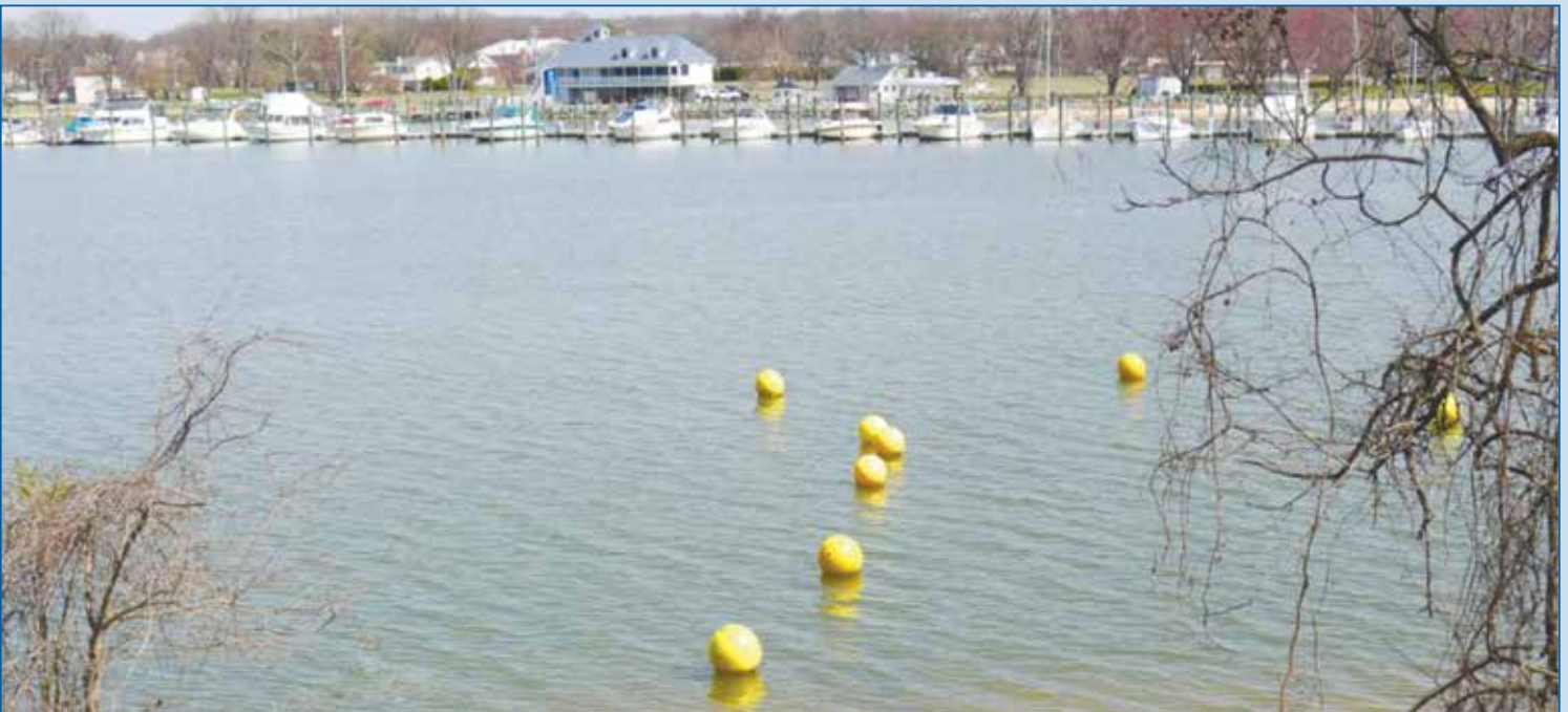
Yellow cautionary buoys mark the area of the treatment facility outfall pipe in Frog Mortar Creek