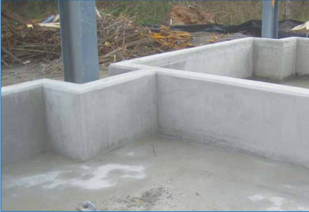
A hardener and sealant were applied to finish concrete floors and containment walls.