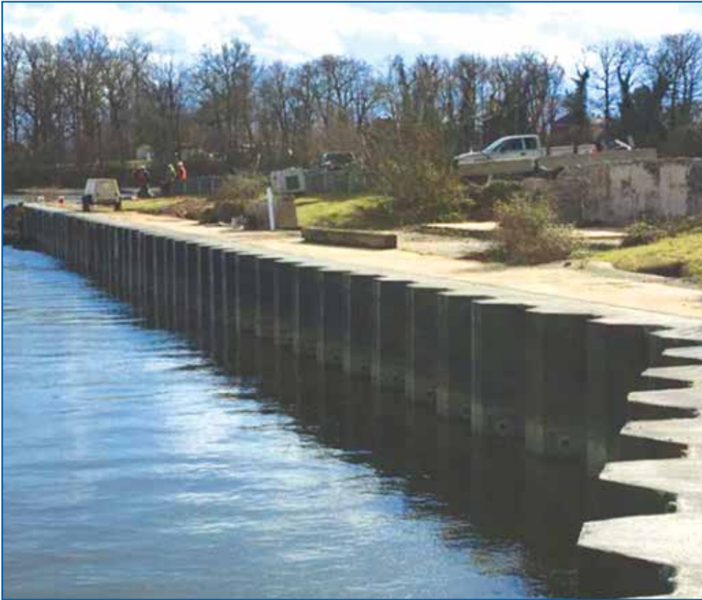
The bulkhead was repaired and is shown at Block F.

primarily targets metals contamination. It is anticipated that over 12,600 cubic yards (about 630 truckloads) of sediment will be removed from the creek.