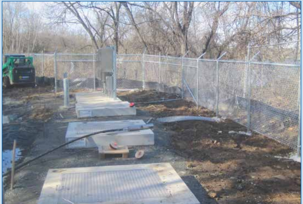
Fencing surrounds the site, including extraction wells, and includes a locked gate allowing access to the outfall pipe on Frog Mortar Creek.