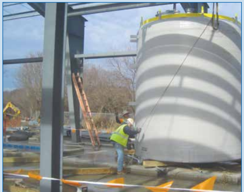
Groundwater treatment tanks were installed while the building was still open to the elements and easily accessible.

Roof panels were installed in early March, followed by windows, doors, and final trim pieces during the remainder of the month. The building should be declared watertight by the end of April.