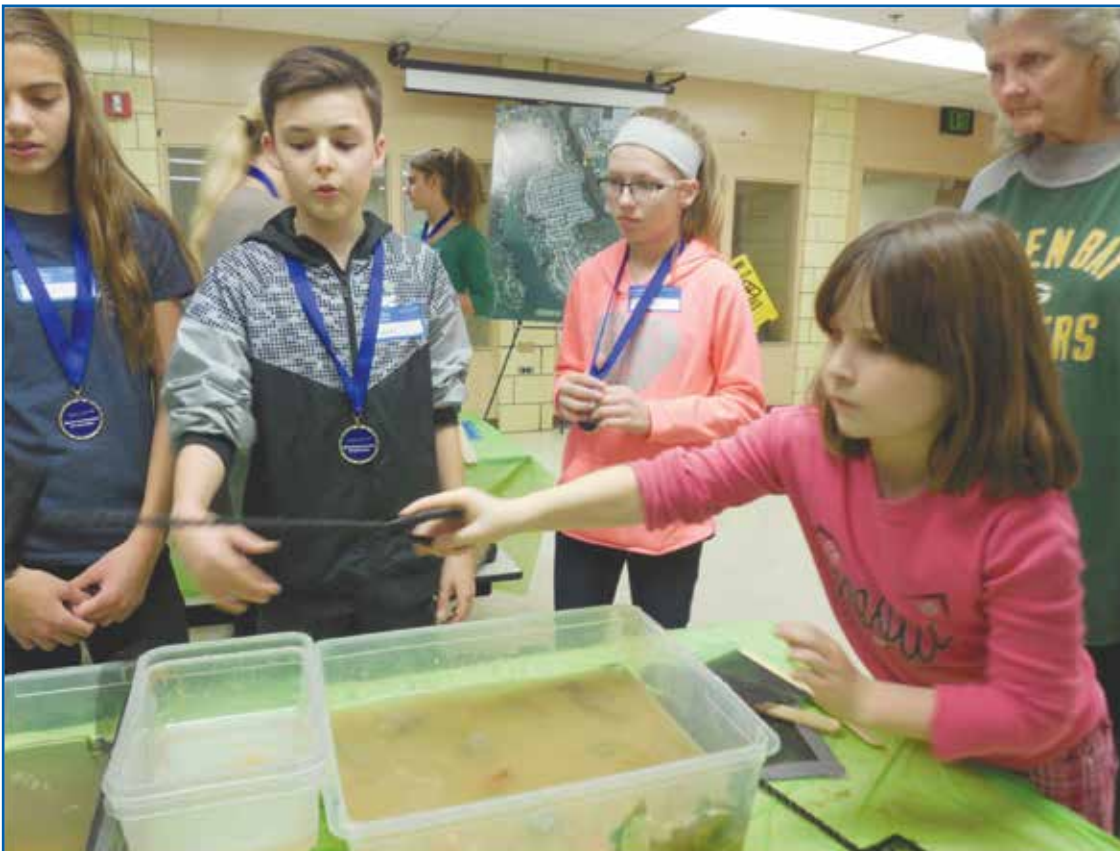
Middle school students challenge an elementary student to net all the fish within the allotted time.

The other two hands-on activity stations were developed by the Lockheed Martin team and showed the excavation and the creek restoration that will follow. Elementary students were eager to participate. Their parents said they had read in Lockheed Martin's newsletters about the upcoming work, and that the STEAM activities really helped explain the process they would see.