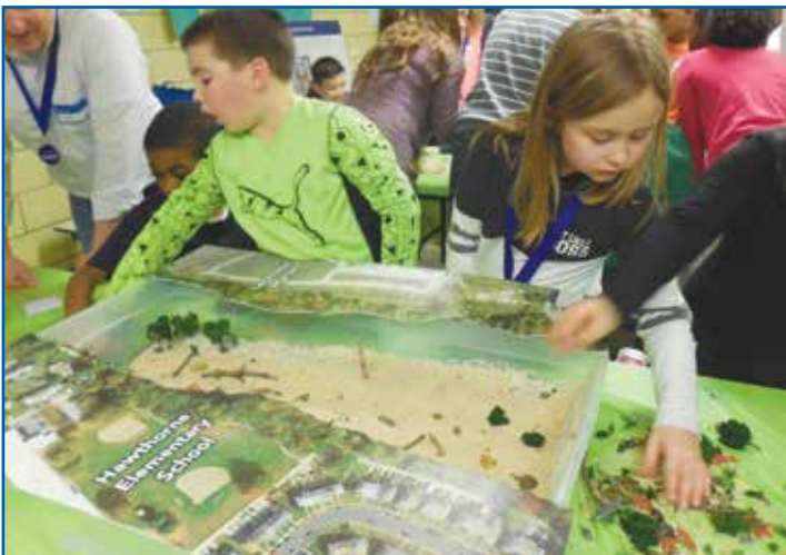
Excavation and restoration projects were presented to help students understand what will be going on.