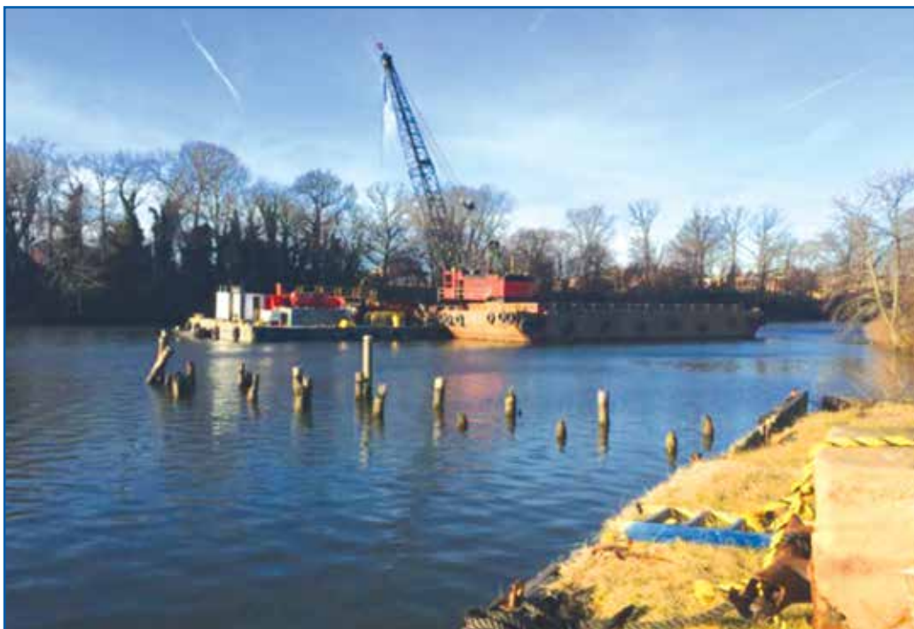
Sediment dredging began at the lower portion of Cow Pen Creek. Sediments were loaded onto a barge for storage, then transported to the offloading area.

Environment (MDE) granted an extension to March 8. Re-dredging during the time extension was completed on Saturday, February 18. Placement of a layer of sand (a “residual management layer”) over the last dredged area was completed by March 3. All in-water work was finished before March 8.