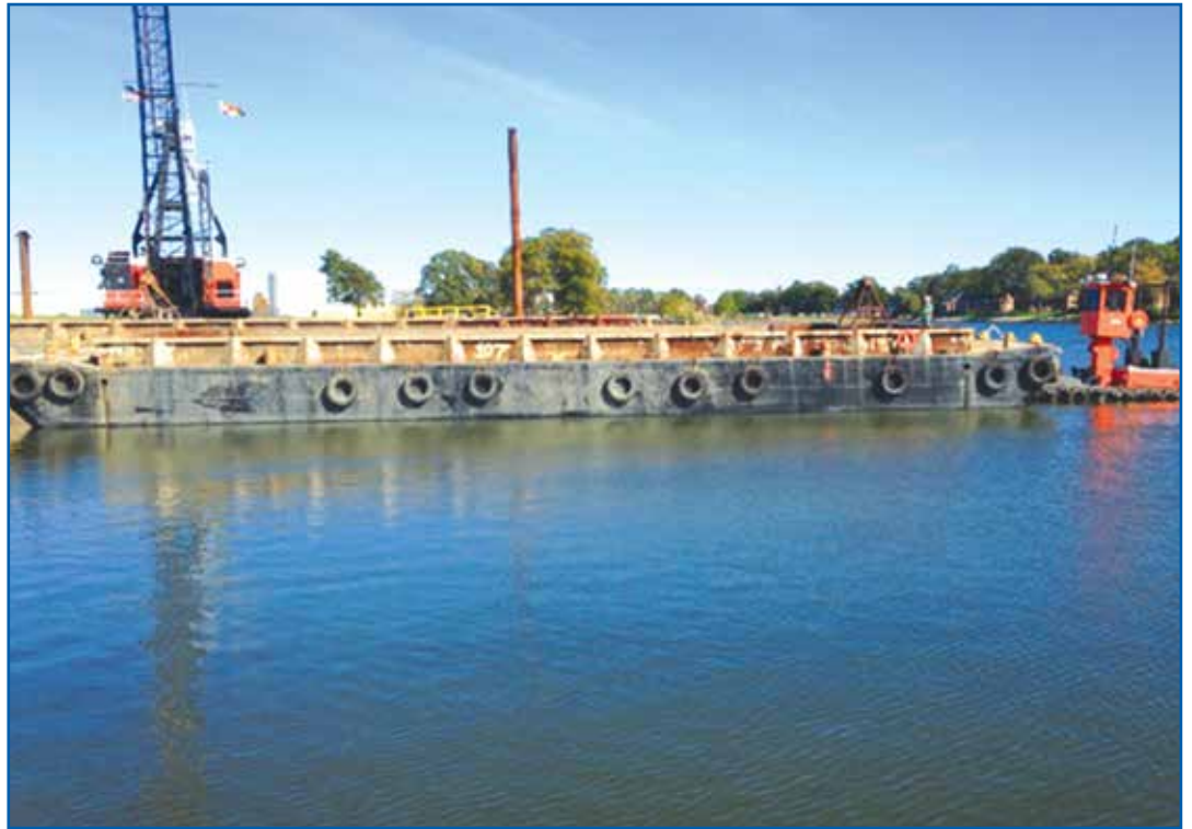
A push-boat moved the barge into position for offloading sediments.

The work was planned to be complete by February 14, the date by which in-water work is typically required to be stopped to protect fish during their spawning season. However, several spots required re-dredging to meet cleanup standards, and while most of that work was finished before February 14, Lockheed Martin needed additional time to re-dredge one remaining area in the cove, and the Maryland Department of the